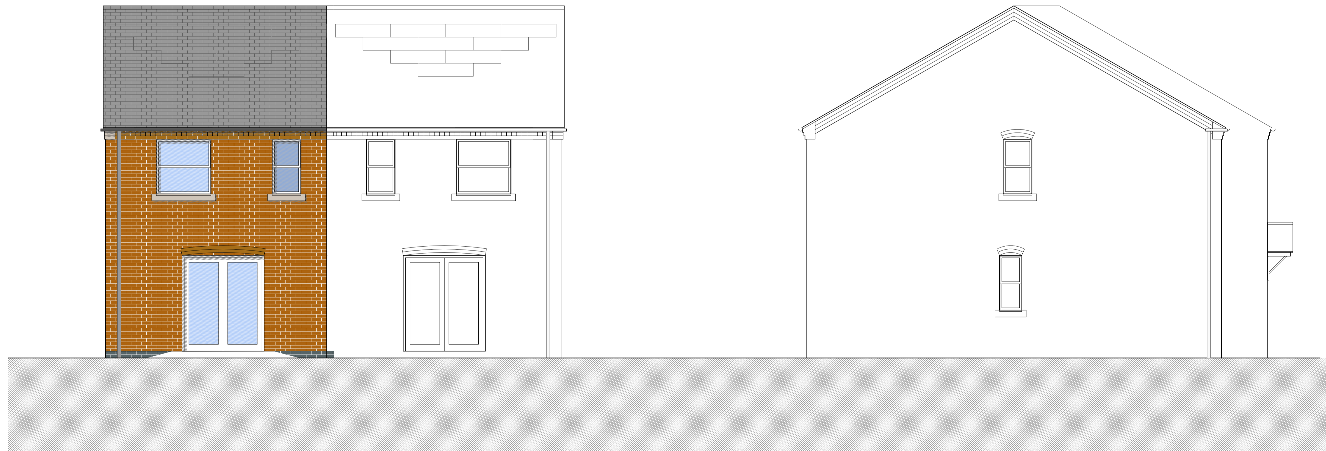
C Rear Elevation